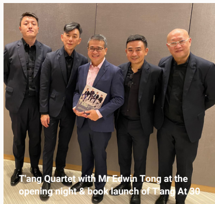
T'ang Quartet with Mr Edwin Tong at the opening night & book launch of T'ang At 30

The opening night was graced by Mr Edwin Tong, Minister for Culture, Community and Youth, who described the concert as a "superb performance". It is one that underlines T'ang Quartet's presence in Singapore's arts and cultural landscape in the last three decades.