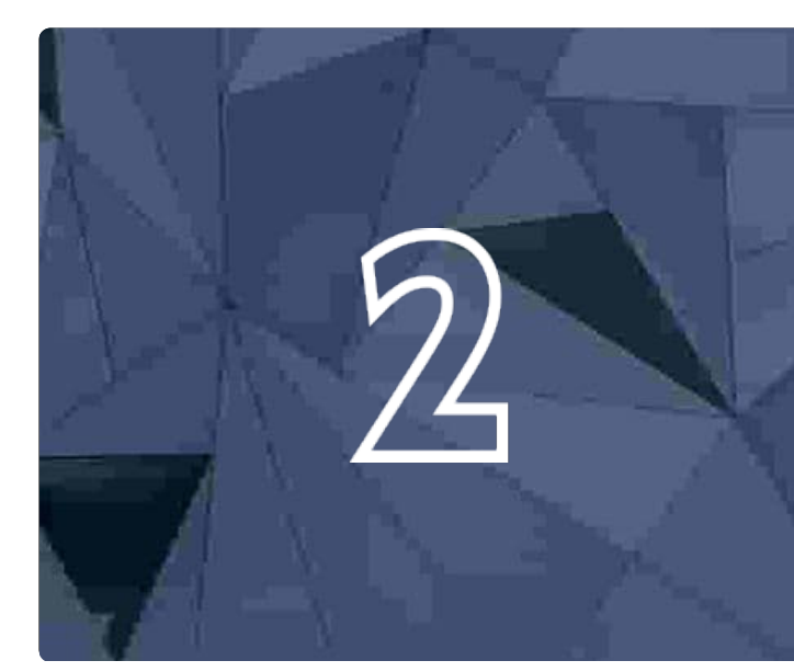
ARTS & CULTURE

KAWS t-shirt collection to launch in UNIQLO stores on Sep 8; features 5 designs to choose from