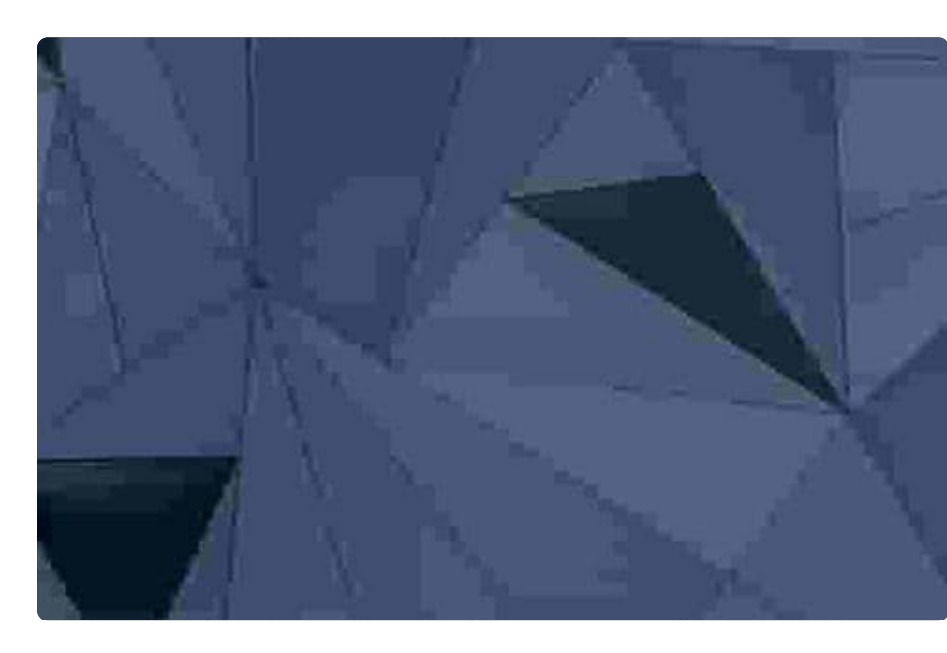
THINGS TO DO

Mid-Autumn festival programmes to be hosted at Sun Yat Sen Nanyang Memorial Hall till Oct 1; features giant panda installations