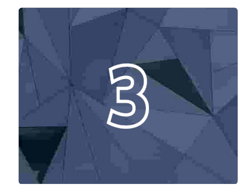
ARTS & CULTURE

Interactive Disney exhibition to make SEA debut in Singapore; features animated films of new and old