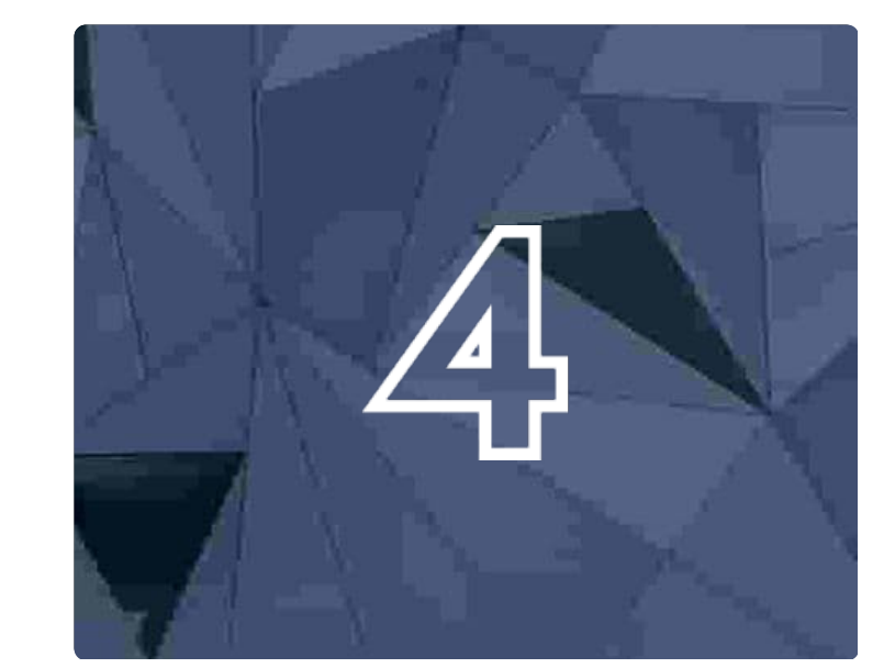
ARTS & CULTURE

Singapore River Festival to be held Sep 7-Oct 1; features live music, light displays, workshops