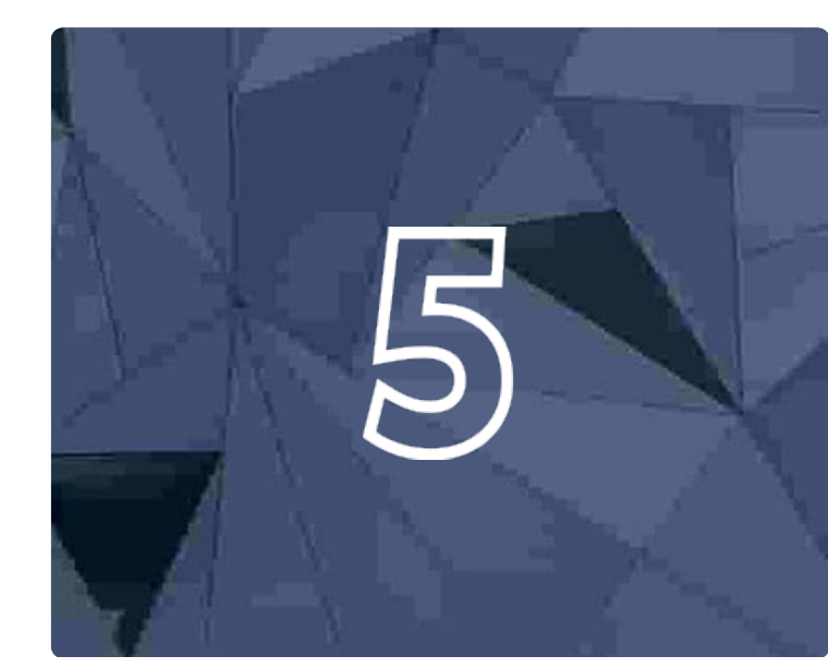
THINGS TO DO

Singapore's first maxi drift bumper cars launched at Timezone Jurong Point, along with additional games