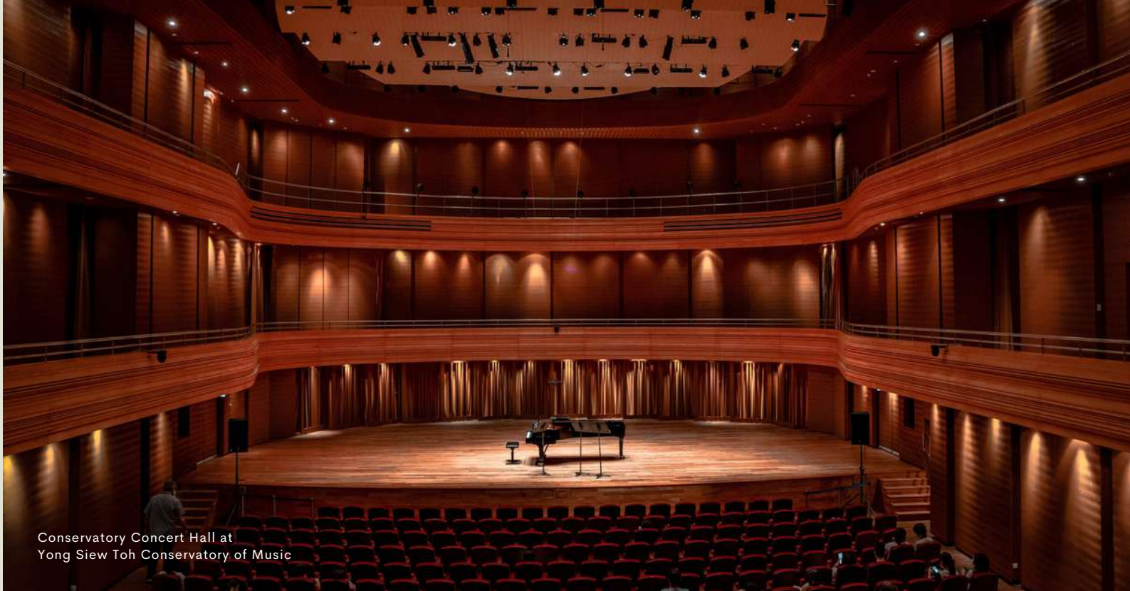
Conservatory Concert Hall at Yong Siew Toh Conservatory of Music

Singapore's preeminent string quartet The T'ang Quartet is taking to the stage at the concert hall at the Yong Siew Toh (YST) Conservatory of Music on March 3. The show, which is also part of YST's 20th Anniversary 2022/2023 Season, is a special one for the ensemble – also YST's Quartet-In-Residence.